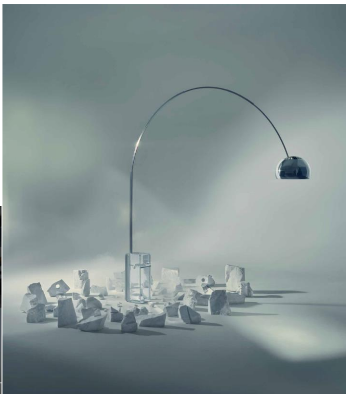
Arco K, designed by Achille & Giacomo Castiglioni

FLOS hub at Fabbrica Orobia during the Milan Design Week